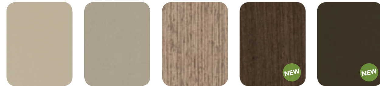
COLOURpyne® Sandstone 1200 ● 1800 ○ COLOURpyne® Café Crumble 1200 ● 1800 ○ COLOURpyne® Antelope Strata 1200 ● 1800 ○ COLOURpyne® Smokey Fineline 1200 ● 1800 ○ COLOURpyne® Jungle Moss 1200 ● 1800 ●