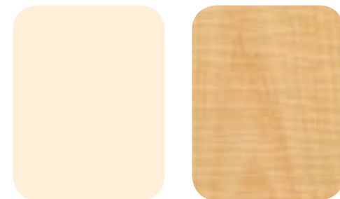
COLOURpyne® Bronx Beige 1200 ○ 1800 ● COLOURpyne® Crossfire Maple 1200 ● 1800 ●