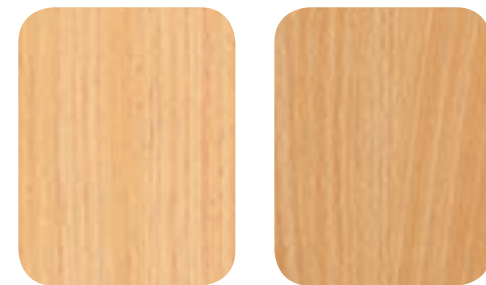
COLOURpyne® Beech 1200 ○ 1800 ● COLOURpyne® Classic Beech 1200 ● 1800 ●