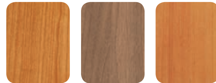
COLOURpyne® Red Cherry 1200 ○ 1800 ● COLOURpyne® Venitzia Walnut 1200 ● 1800 ● COLOURpyne® Planked Pear 1200 ● 1800 ○