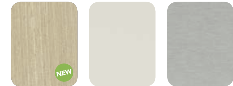
COLOURpyne® Balsa Fineline 1200 ● 1800 ○ COLOURpyne® Folkstone 1200 ● 1800 ● COLOURpyne® Silver Haze 1200 ● 1800 ●

● Colour available ○ Colour not available