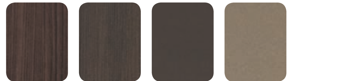
COLOURpyne® Myanmar Teak 1200 ○ 1800 ● COLOURpyne® Mocha Fineline 1200 ● 1800 ● COLOURpyne® Macchiato 1200 ● 1800 ● COLOURpyne® Cinnamon Crumble 1200 ● 1800 ●